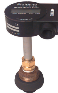
2200 Series with optional display and Thredolet® mount